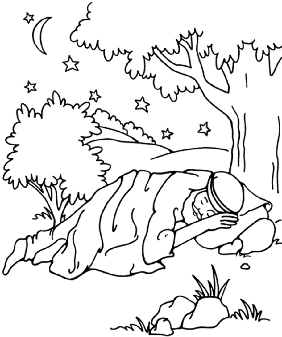
God Cares for Jacob